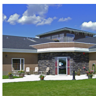
Bethel Pentecostal Church 5410 53 Ave. Barrhead, AB T7N 1C4