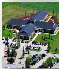
Bethel Pentecostal Church 5410 53 Ave, Barrhead, AB T7N 1C4 780-674-3529 office@barrheadbethel.ca