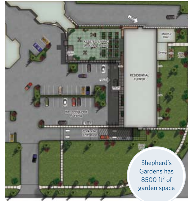
Shepherd's Gardens has 8500 ft 2 of garden space

A. The new project provides a complete aging-in-place community in Mill Woods. The project will be top quality at affordable prices.