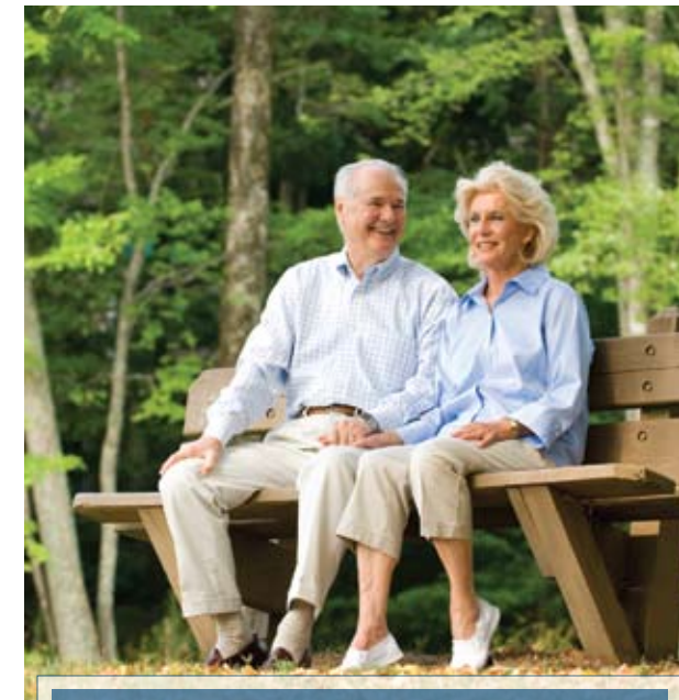
RELAX IN COMFORT